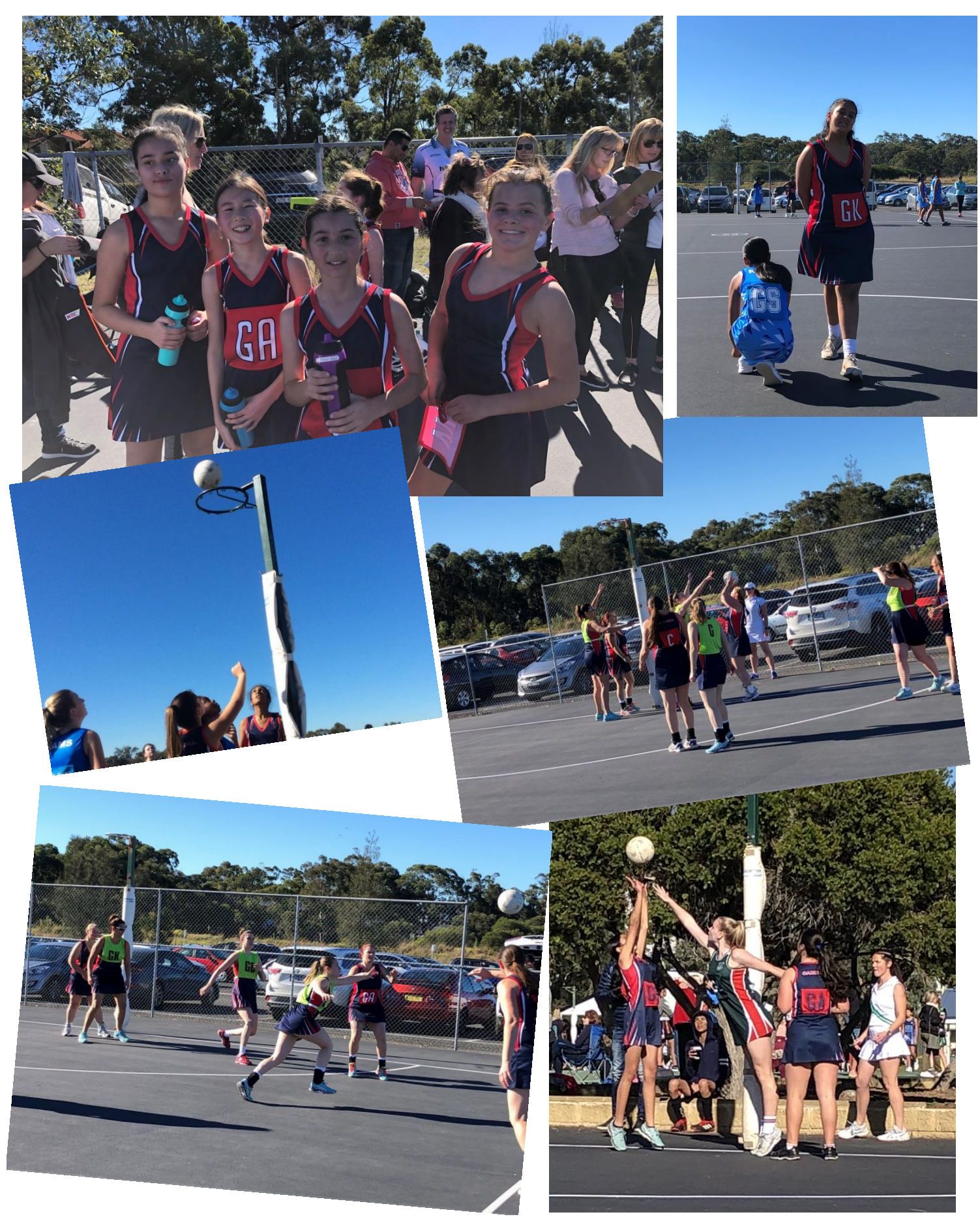
Good Luck in Round 11!