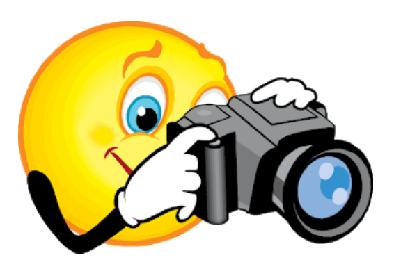
Photo Day - information will be distributed to all teams this Saturday. The allocated timeslots have been carefully organised around game times and umpiring commitments.

Please ensure your team is advised of the timeslot and ALL players make every effort to attend (even the NetsetGo players from Friday nights) this is our 25th year of Netball, we want every player be a part of our clubs ongoing history.