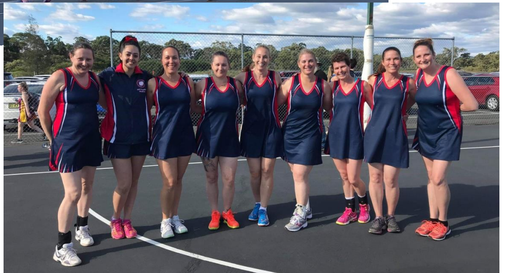
Round 4 – Keep all comments positive this week for Shoosh Week