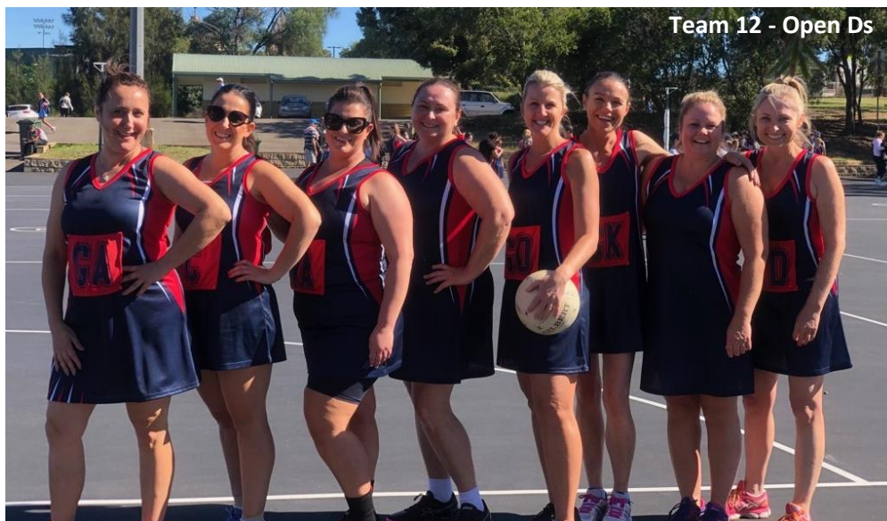
Team 12 - Open Ds