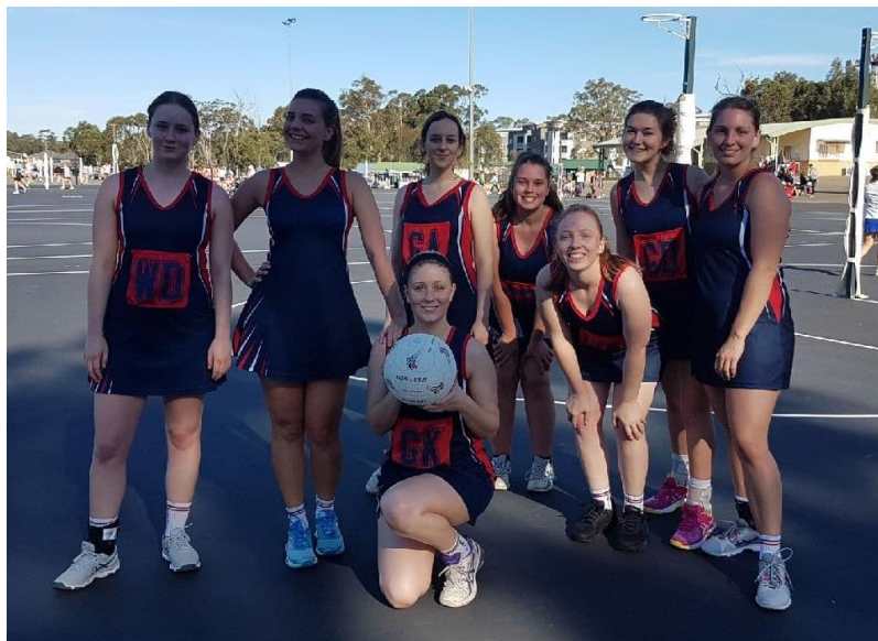
C4 Sisters -v- Kenthurst FINAL

As the match commenced, so did the rain at Kellyville! The game was slowed due to the conditions, but intense. Scores were even up to half time. Kenthurst managed to break away in the 3 rd quarter with a quick succession of goals and our girls were unable to recover. Speed is the weapon for our C4 sisters and in the wet, it was just too dangerous to run and weave in their usual fashion and the opposition managed to take the win. What a fabulous effort though by our C4 sisters! They finished up with a Minor Premiership under their belts, well done girls!