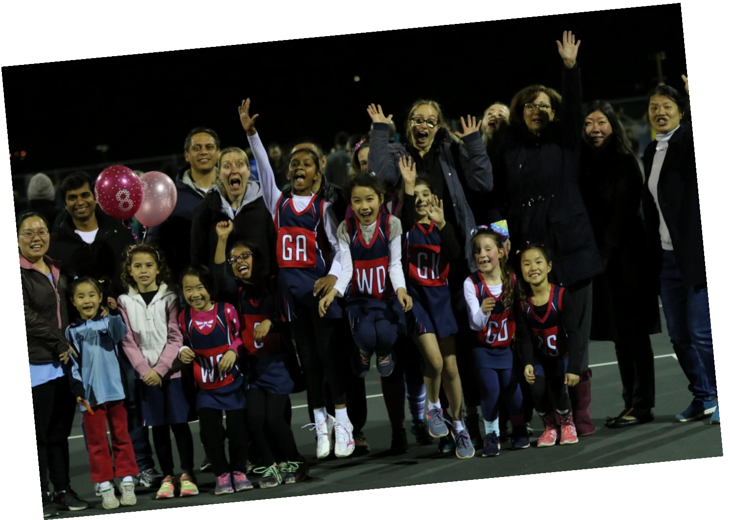
Good Luck in the Semi-Finals.....Cheer loudly!